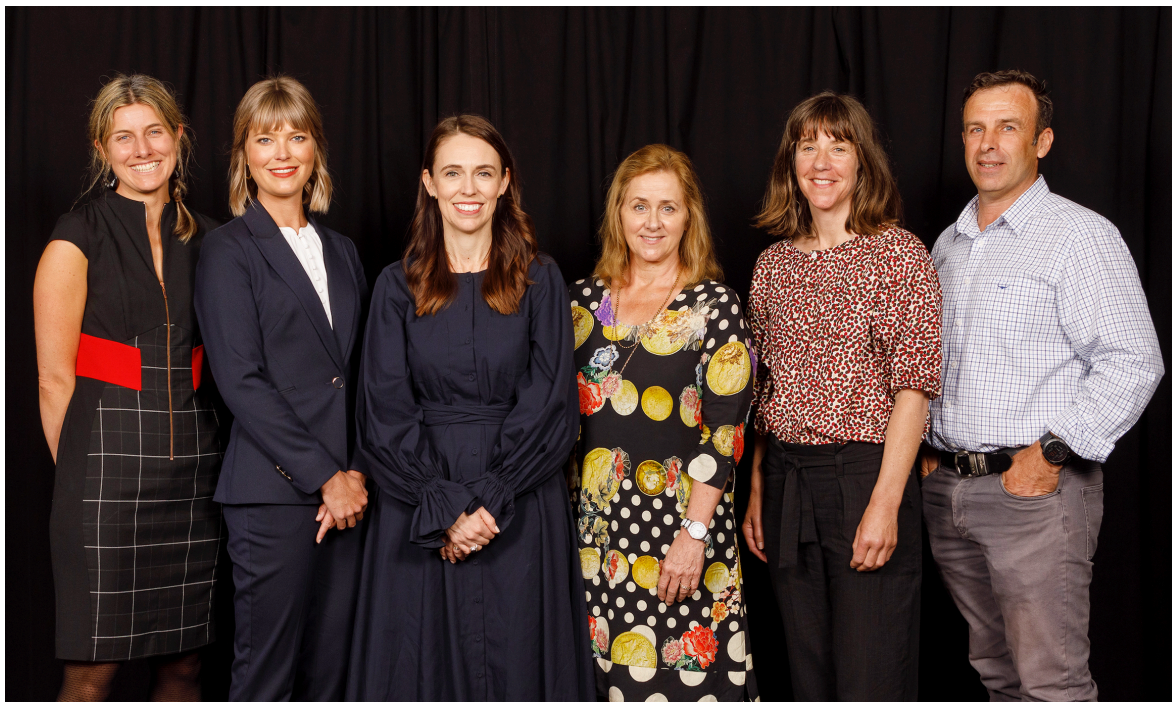
NZFWC 12.3 Trustees and Executive Director with Prime Minister Jacinda Ardern at the launch of Kai Commitment, 2nd November 2022

Our Champions' work streams are made possible through philanthropic funding and grants. In the past we have been supported by Whakatupu Aotearoa Foundation, The Tindall Foundation, AGMARDT, Ecostock, Countdown and WasteMINZ.